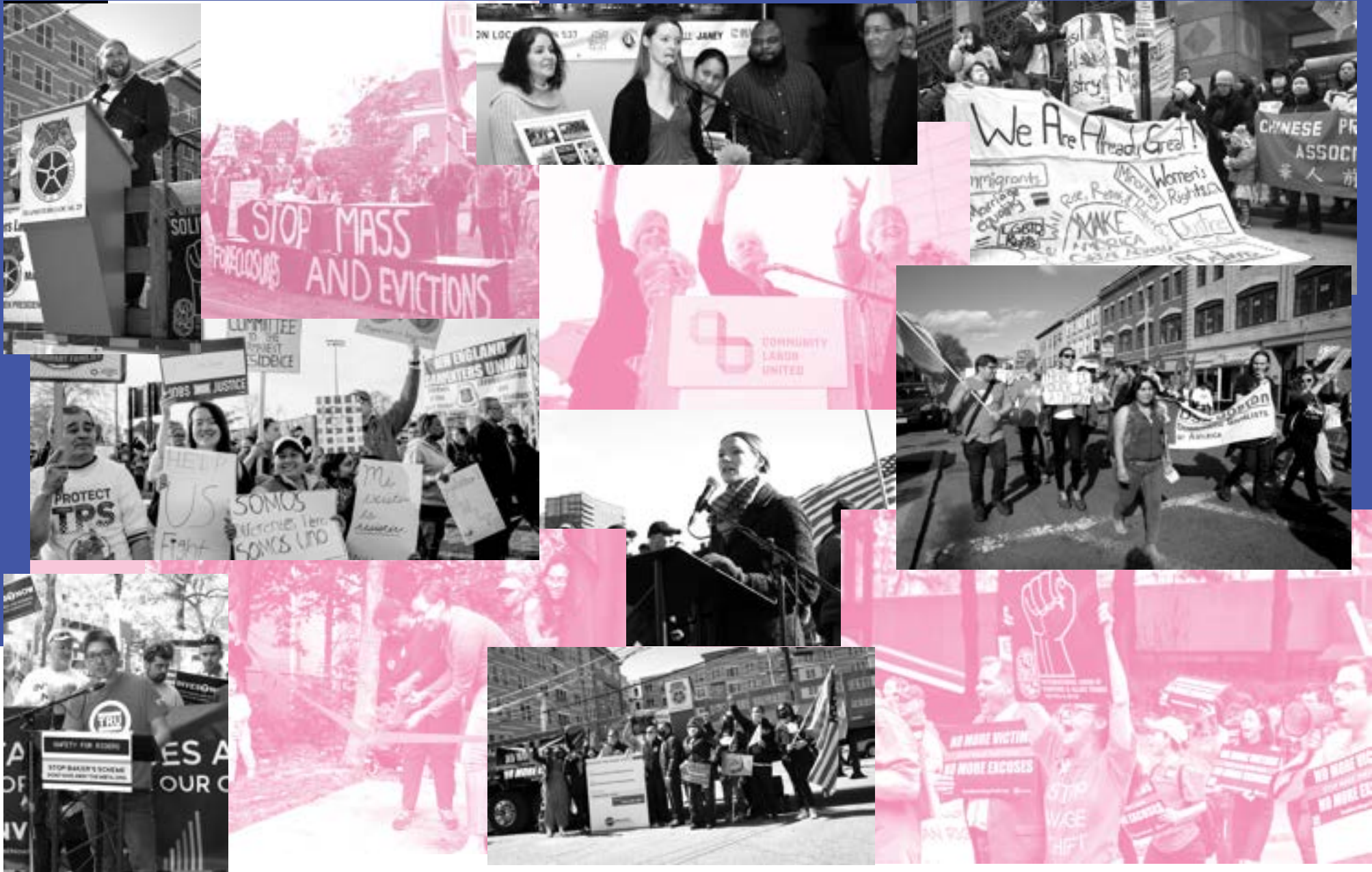
*Some images on this page were captured before the pandemic.